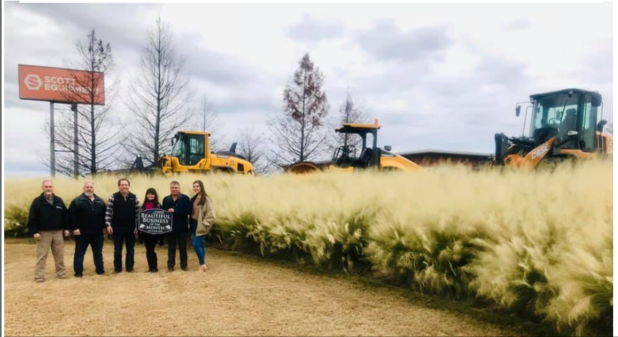
The Beautiful Business for the month of December 2018 is Scott Equipment. The business is located on US 165 at the I-20 Exit in Monroe.